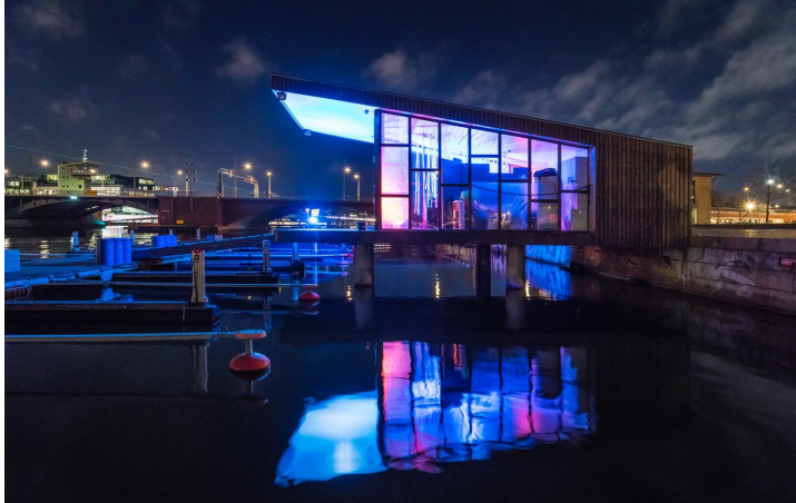
Several installations will be positioned along the waterfront at the next Copenhagen Light Festival (Copenhagen Light Festival).