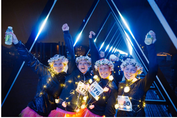
The Light Run will take place on Sunday, February 9th, in the city center. (Copenhagen Light Festival).