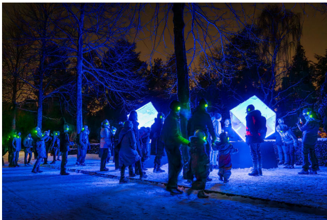
Guided tours are held at various locations around the city, sharing the story behind each piece. (Copenhagen Light Festival).

Guided tours have been very popular and are now available for booking on the website. The installations, created by talented artists, are free to view and beautifully displayed outdoors. Guides provide background stories and insights behind the artworks during tours that last just over an hour, available on foot or by canal with Strømmå.