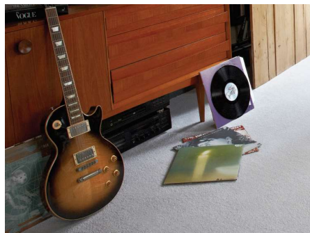
FREE Underlay or FREE Fitting on Many Carpets*