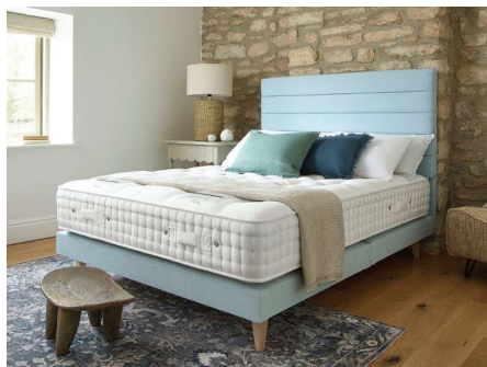
Luxury Hand-made Beds & Mattresses