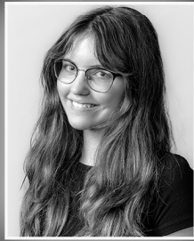
INDIA HILL Ensemble