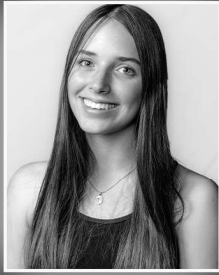
MEGAN FOX Ensemble