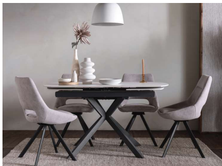
Many New Dining Collections