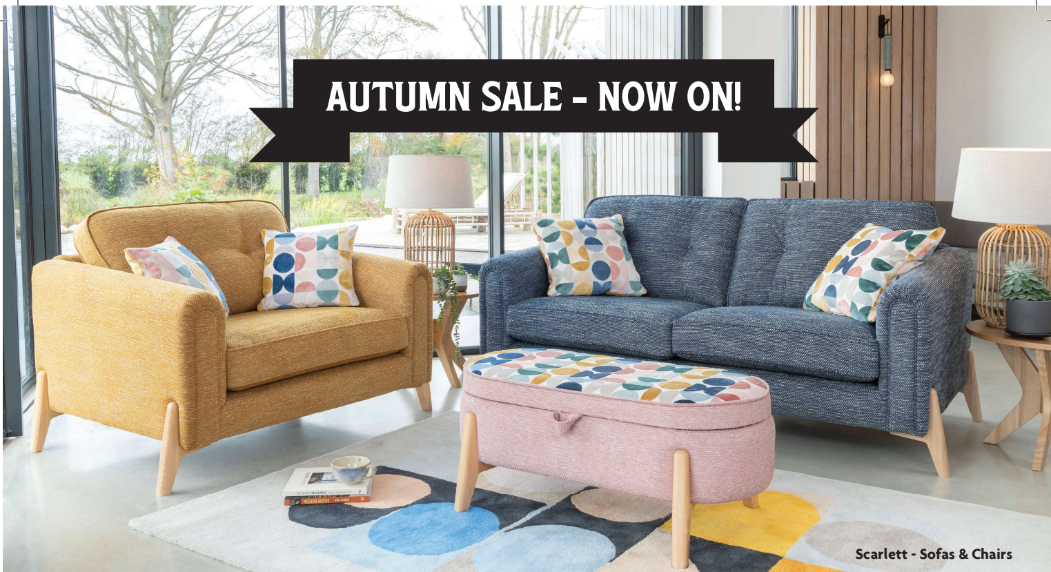
Scarlett - Sofas & Chairs