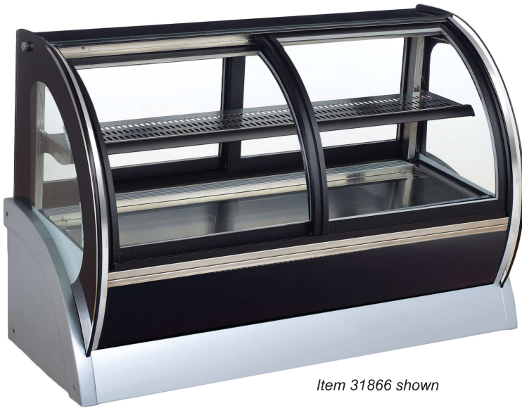
Item 31866 shown