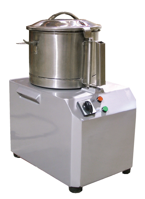
3.2-Quart / 3-Liter