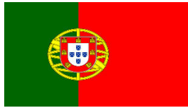
Ministry of Science, Technology and Higher Education of the Portuguese Republic

The undersigned endorse the Lisbon Declaration on the Humanities, Open Research and Innovation,