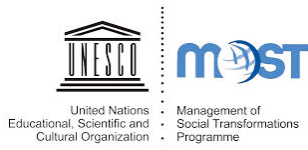
United Nations Educational, Scientific and Cultural Organization – Management of Social Transformations (UNESCO-MOST)