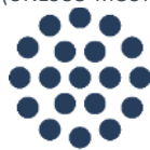
International Science Council (ISC)