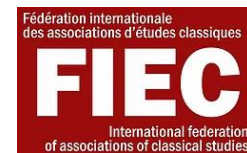
Fédération Internationale des Études Classiques (FIEC)