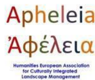
International Association for Humanities and Cultural Integrated Landscape Management (APHELEIA)