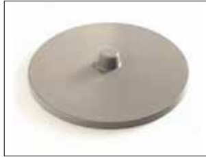
Lid for Longopac Stand Classic Maxi and Mini Mini Item no. 31140 Maxi. Item no. 30140