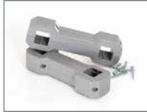
Connector for Longopac Stand Classic Item no. 33750 Connects two or more Longopac Stand products simply and securely. It is also possible to connect Maxi to Mini.