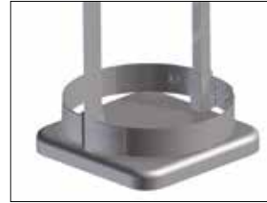
Frame for Longopac Stand Classic Maxi Item no. 33900 The frame holds the bag in place.