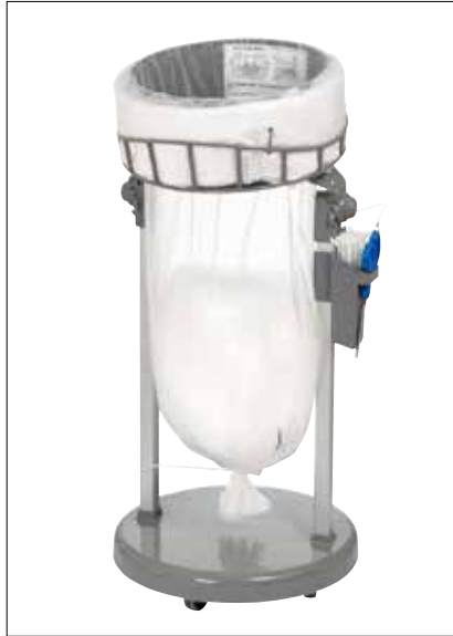
Stand Classic Mini/Mini Food