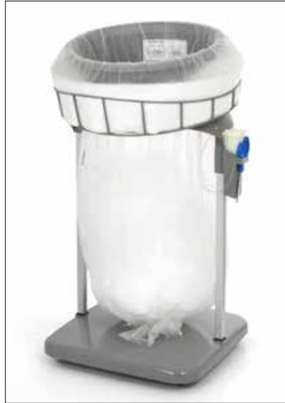
Stand Classic Maxi/Maxi Food