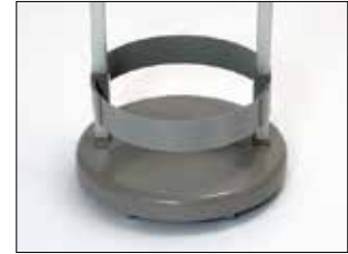
Frame for Longopac Stand Classic Mini Item no. 33890 The frame holds the bag in place.