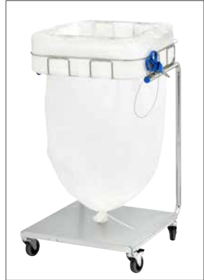
Stand Dynamic Maxi/Maxi Pedal