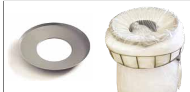
Adapter disc for Longopac Stand Classic Maxi Item no. 30170 Reduces the aperture for easier compression of e.g. recycled plastic. Only available for Maxi.