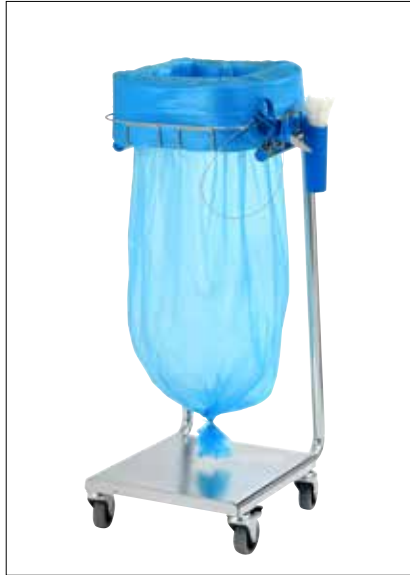
Stand Dynamic Mini/Mini Pedal