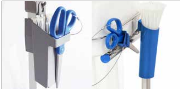
Cable-tie holder for Longopac Stand Classic Standard, grey. Item no. 30410 Metal-detectable, blue. Item no. 30416

The cable-tie holder speeds up bag changes even more and holds the cable ties in place. Suitable for both Maxi and Mini, and available in two versions.