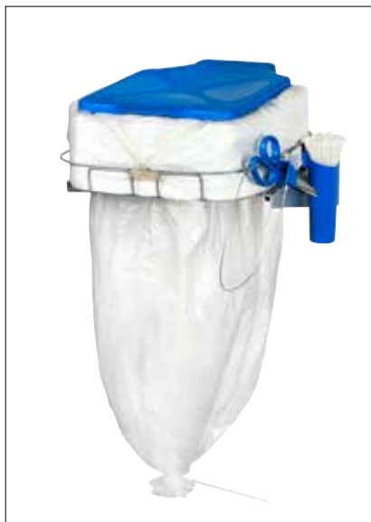
Mini Flex with lid

Wall-mounted solutions are ideal for areas with limited space and where hygiene is important. They also facilitate cleaning.