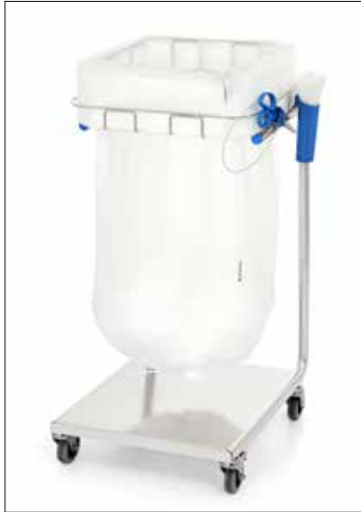
Stand Dynamic Midi/Midi Pedal