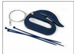
Safety kit Cutter blue kit Item no. 30440 Contains cutter, metal detectable PP. Wire in stainless steel and cable ties, metal detectable PA