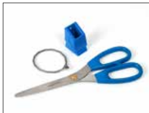
Scissors kit for Longopac Stand Dynamic, metal-detectable Item no. 34609 Kit containing metal-detectable scissors, scissors holder, stainless steel wire.