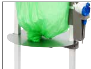
Adjustable plate for Stand Classic Mini Item no. 31480 Reduces the consumption of bag material and reduces the size of the bag. Primarily intended for use with sticky, heavy waste. Can be used for Bio bag cassettes.