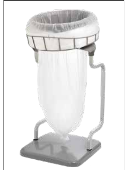
Stand Classic Recycling