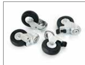
Stand Dynamic ESD Kit Wheels Item no. 34616 Contains four castor wheels, two of them with brakes. Replaces the original wheels on stands used in ESD restricted areas.