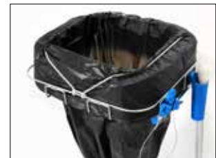
Rubber band Item no. 3102 This accessory can be used together with all Longopac cassette holders. Effectively locks the cassette in place and prevents it from unravelling.