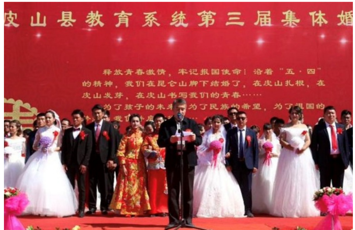
Uyghur women forced to marry Han Chinese men in group ceremonies under the CCP's supervision, with the ceremonies are overseen by armed security guards.