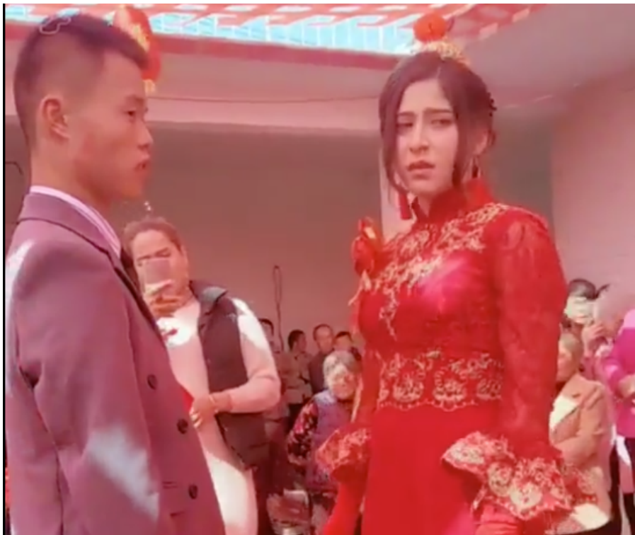
Uyghur woman forced to marry a Han Chinese man.

These coerced marriages the the Chinese governments attempts are further eradicating the Uyghur culture and forcefully assimilating them into Han Chinese culture. In order to encourage these mixed marriages, the Chinese government gave monetary incentive. When those failed, videos were produced of "happy couples" and magazine articles on "how to win a Uyghur girls heart"