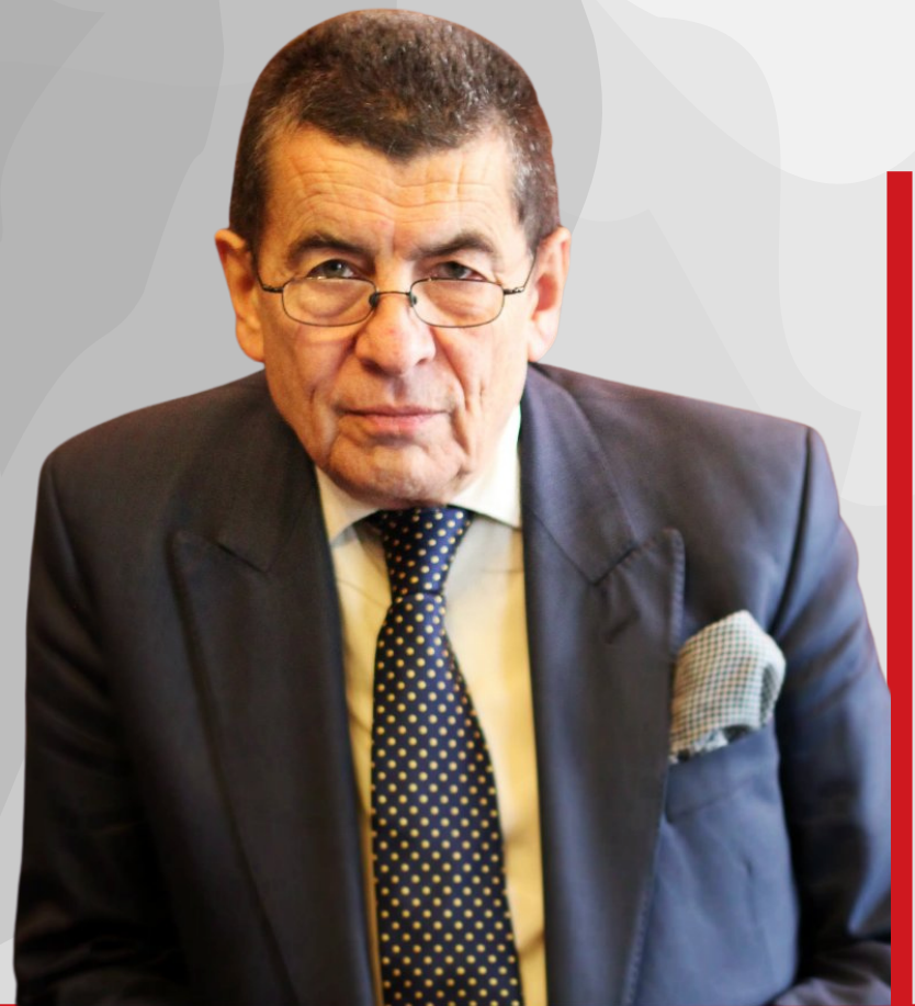
Sir Geoffrey Nice QC, British Barrister Chair of the China Tribunal

“There is no evidence of the practice having been stopped and the tribunal is satisfied that it is continuing.”