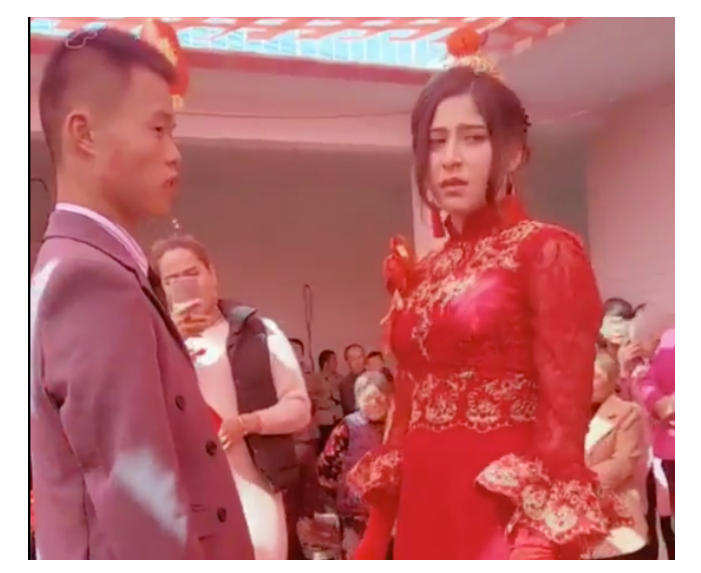
Uyghur woman forced to marry a Han Chinese man.

Having young Uyghur girls forced to marry Han Chinese men is a step towards changing the demographics in East Turkistan, in particular, as a result of the Chinese who come to stay in Uyghur houses as permanent guests and marry the young girls living there. Parents are unable to object to the marriage because if they do, they are sent to the camps. In order to disrupt the Uyghur family structure, the Beijing administration offers the Han Chinese money, jobs, and free homes for these arranged marriages. The Communist Party successfully spreads propaganda through films and advertisements and other broadcasting organs in order to recruit candidates for the forced marriages.[19] The government goes a step further and employs social security officers for the weddings. The purpose of the officers is to guide the Han Chinese men during the wedding and to 'persuade' the meeting of the Uyghur girls and their families. Uyghur men are constantly broadcasted as 'terrorists' by the Chinese Communist Party through heavy propaganda methods. On the other hand, Uyghur women are advertised as 'sexual items.' This is another method of forcibly changing the family dynamic and the living conditions in the region. [20]