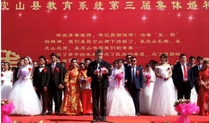
Uyghur women are forced to marry Han Chinese men in group ceremonies under the watchful eye of the CCP to make sure total compliance from the Uyghur women and their families.