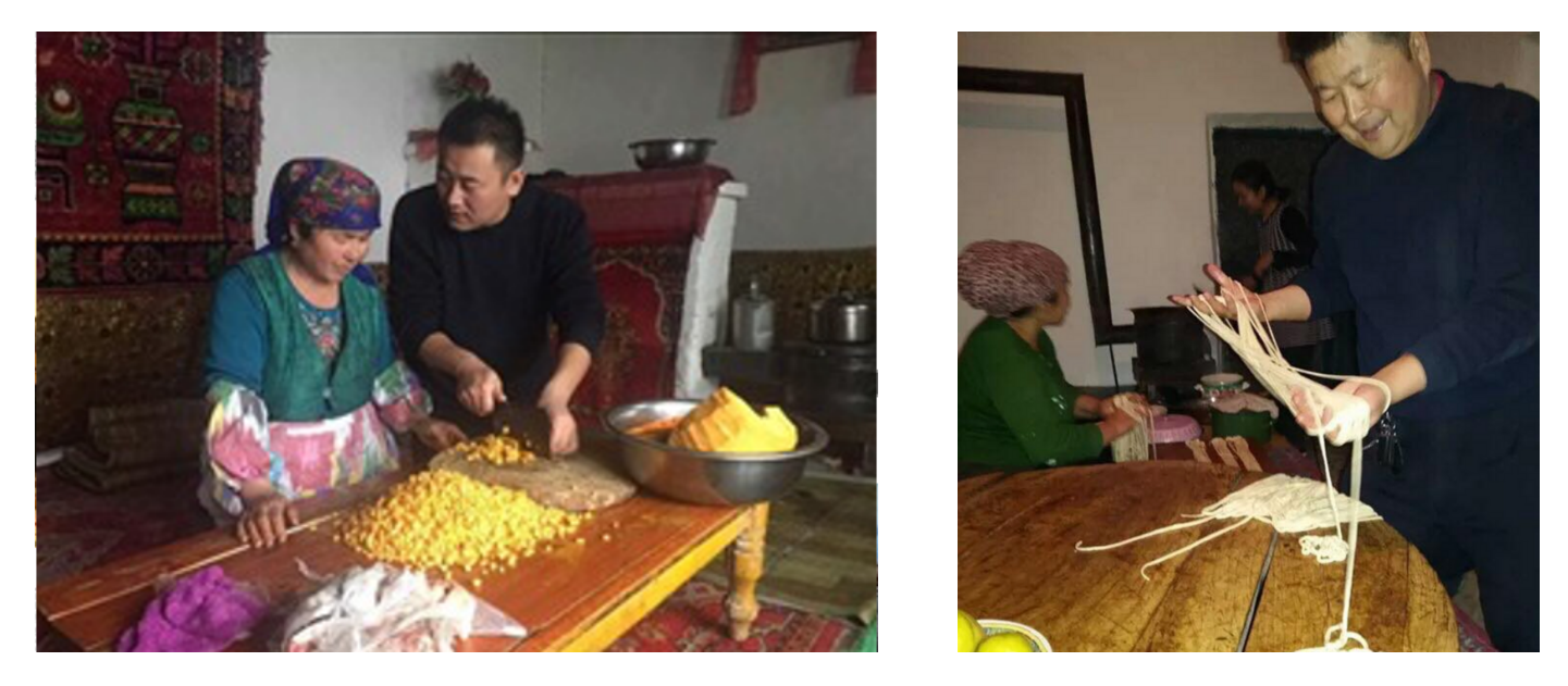
Han Chinese are given monetary incentives to move into the homes of Uyghurs and monitor their daily lives. Han Chinese men occupy homes of women who live alone because their husbands have been placed in concentration camps and forced labor facilities.

The government started to make it mandatory for the Han Chinese to migrate to the region, as they send Uyghurs to work in China proper. This is to eliminate the Uyghur people and force them to forget their identities amidst the Chinese population of over 1 billion. In order to keep the economic power of the region afloat, Han Chinese are given Uyghur homes as incentive, while Uyghurs are forced to migrate out of East Turkistan.