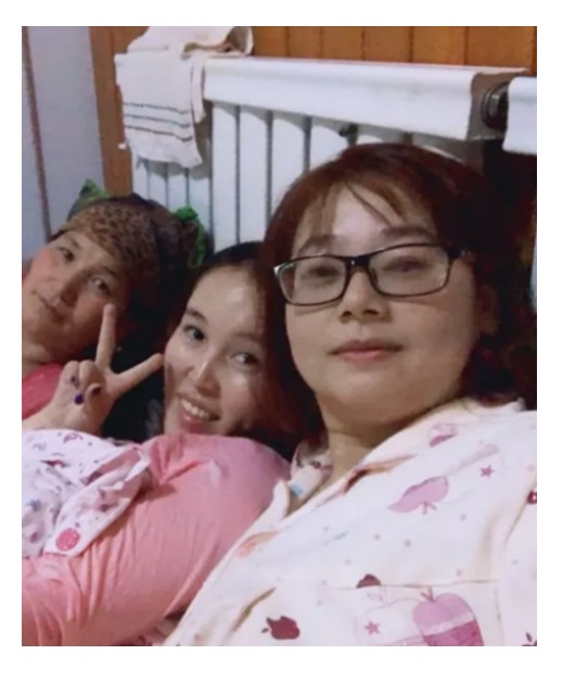
Two sent-down "relatives" share a bed with their Uyghur host.