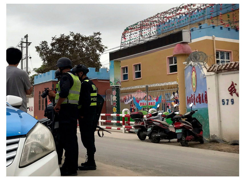
China is placing Uyghur children in Chinese state-run orphanages even if their parents are alive. The schools are equipped with barbed wires, watch towers and armed guards. @Independent