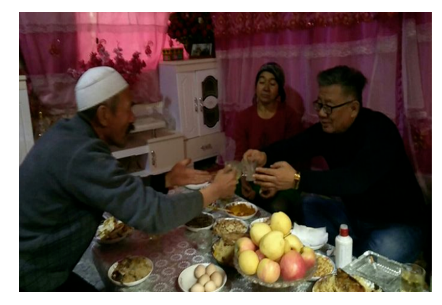
A visiting Han civil servant asks a Uyghur villager if he smokes or drinks liquor, and the two drink together. This image was posted on social media platform Meipian by the Han civil servant in a diary article about his homestay experience.

In an effort to change the demographic structure of East Turkistan, the Chinese government sends Uyghurs to work in forced labor facilities in mainland China.