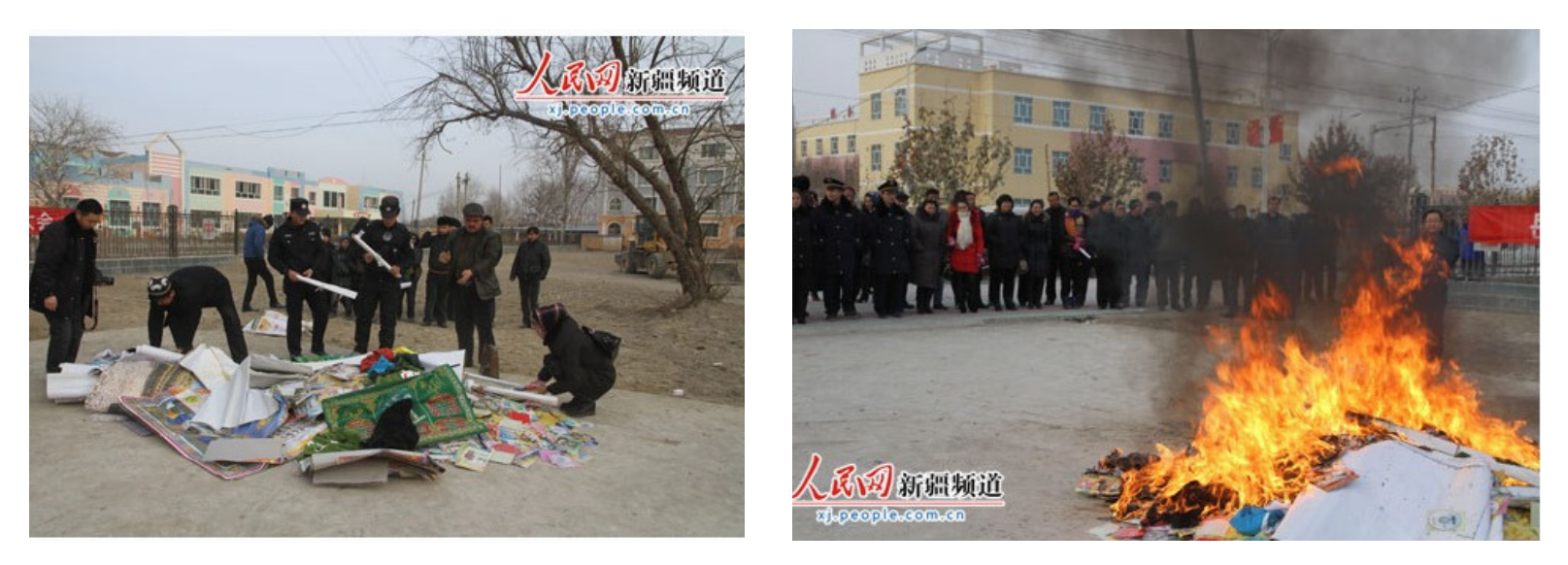
The Chinese government ordered for the burning of the holy Qur'an, prayer rugs and all religious materials

The condition that the perpetrators will be granted extradition, regardless of country, and not being accepted as a political crime is stated in Article VII. It is also guaranteed in the other articles of the contract that the signatory States can ask the U.N. for help if necessary, and in case of need, the matter is brought to the International Court of Justice with the request of one of the parties.[8]