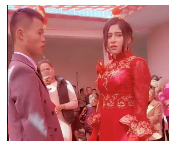
Uyghur woman forced to marry a Han Chinese man.

Having young Uyghur girls forced to marry Han Chinese men is a step towards changing the demographics in East Turkistan, in particular, as a result of the Chinese who come to stay in Uyghur houses as permanent guests and marry the young girls living there. Parents are unable to object to the marriage because if they do, they are sent to the camps. In order to disrupt the Uyghur family structure, the Beijing administration offers the Han Chinese money, jobs, and free homes for these arranged marriages. The Communist Party successfully spreads propaganda through films and advertisements and other broadcasting organs in order to recruit candidates for the forced marriages. [20] The government goes a step further and employs social security officers for the weddings. The purpose of the officers is to guide the Han Chinese men during the wedding and to 'persuade' the meeting of the Uyghur girls and their families. Uyghur men are constantly broadcasted as 'terrorists' by the Chinese Communist Party through heavy propaganda methods. On the other hand, Uyghur women are advertised as 'sexual items.' This is another method of forcibly changing the family dynamic and the living conditions in the region.[21]