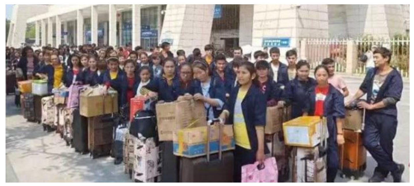
The Chinese government transporting Uyghur, Kazakh and other Turkic Muslim youth out of East Turkistan to work in factories in China proper.