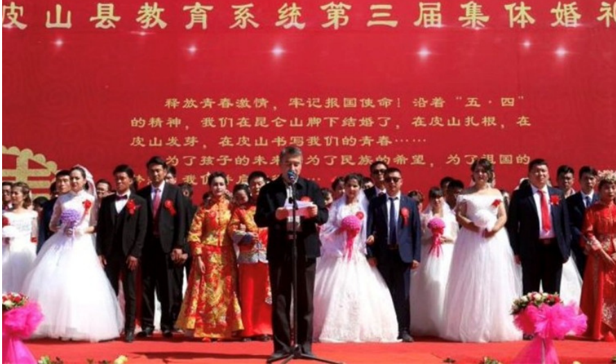
Uyghur women are forced to marry Han Chinese men in group ceremonies under the watchful eye of the CCP to make sure total compliance from the Uyghur women and their families.