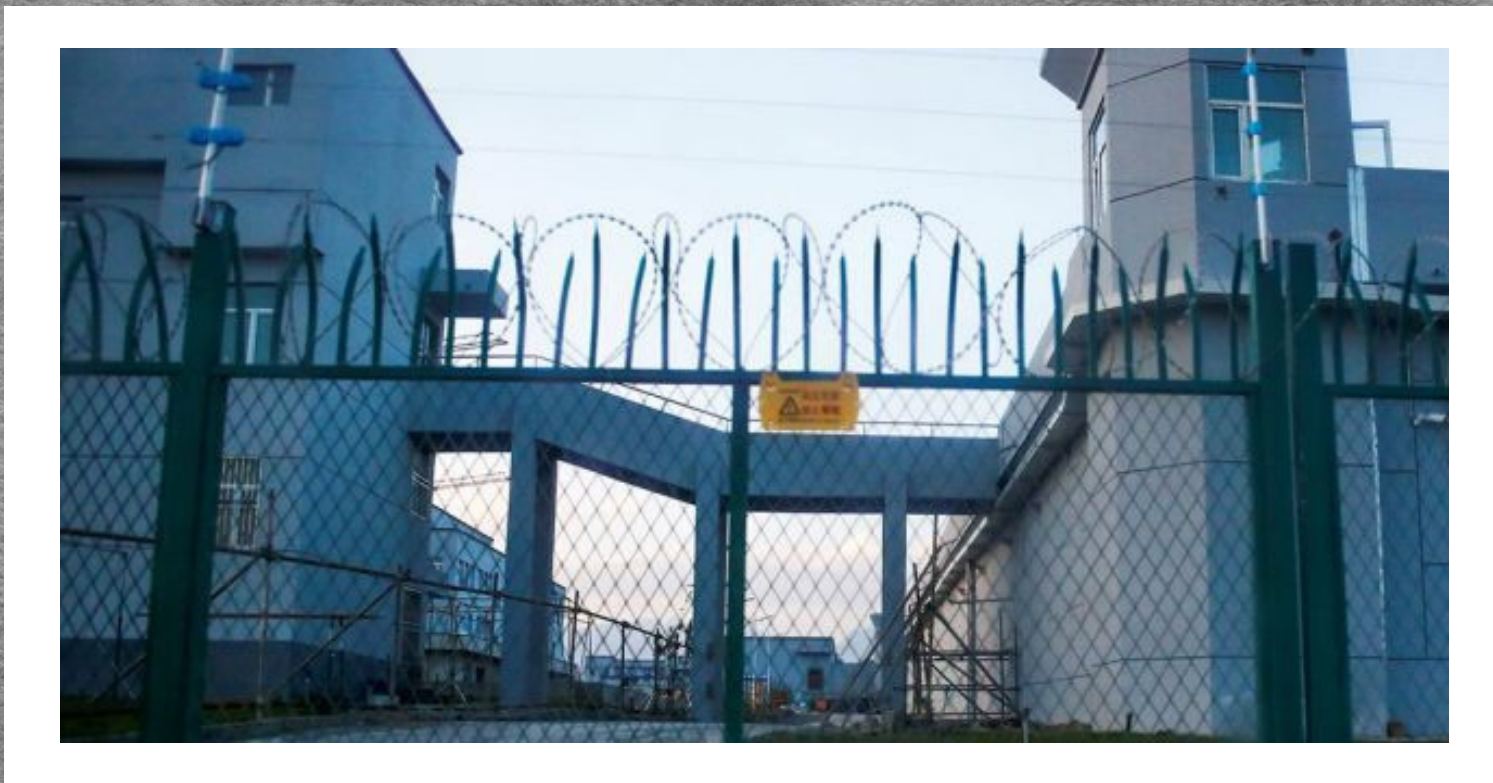
A PERIMETER FENCE COVERING THE PERIMETER OF WHAT THE CCP REFERS TO AS "VOCATIONAL EDUCATION CENTRE" IN DABANCHENG IN EAST TURKISTAN, SEPTEMBER 4, 2018