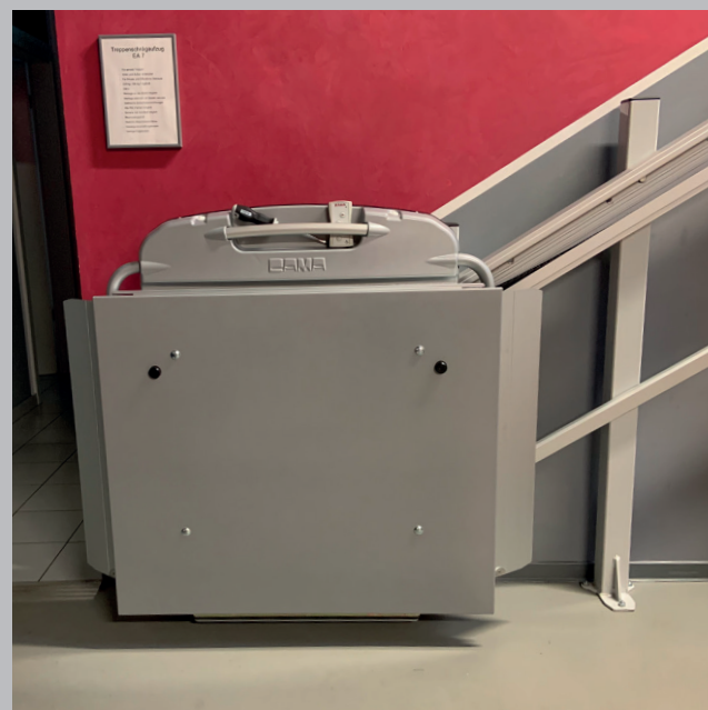
Platform Lift – Straight

CAMA Lift ApS Ellehammervej 6 . 9900 Frederikshavn Tlf: +45 98 43 01 22 . E-mail: cama@cama.dk www.cama.dk