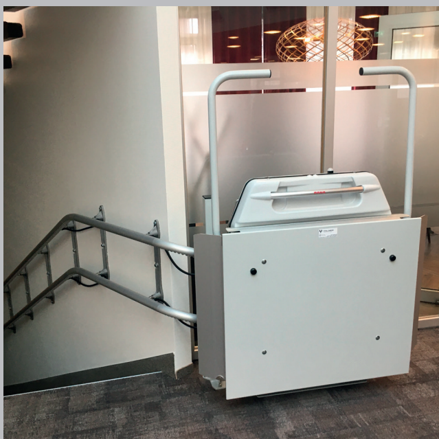
Platform Lift – Curved