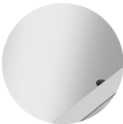
Plate welded to the hob that provides a larger cooking zone and eliminates dirt accumulation areas.

A 10-mm tilt of the plates toward the front of the machine allows for optimal grease outflow to the grease pan.