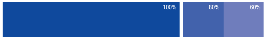
World Archery Reflex Blue

The brand colours are specified in the chart below but it is unlikely that you will ever have the opportunity to print the landmark in its six special PMS colours—these are mainly for definition purposes. However, in these days of digital printing and when much communication is online, the need to limit the number of colours has largely gone. We should take full advantage of this.