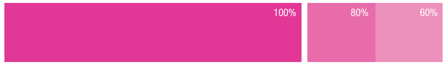
World Archery Pink