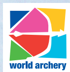
The brandmark on a light area of a photograph - still retains the white panel.