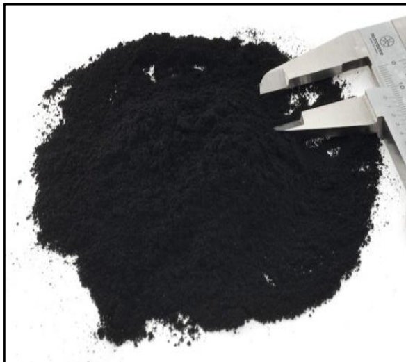
P.A.R. physical active rubber ready to be re-vulcanised