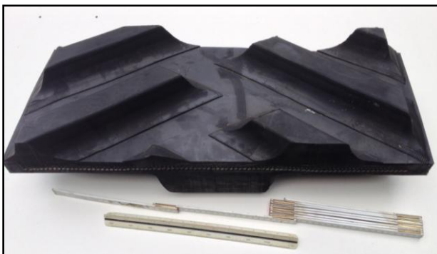
Agriculture track (repair & recycling)