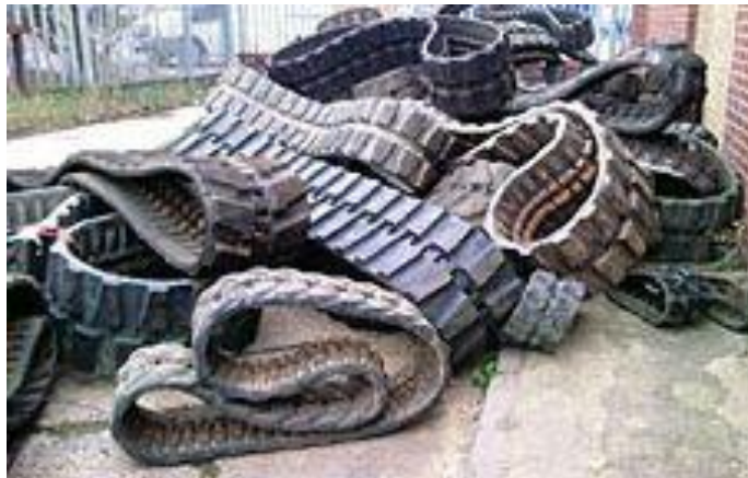
and dumped construction tracks.