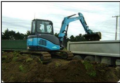
Traditional digger with track

Containing: steel cleats, cables and rubber layer covering both sides.