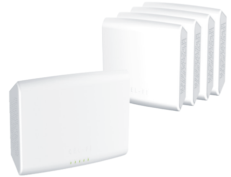
CEL-FI QUATRA 1000