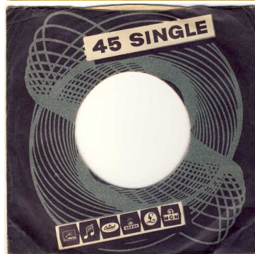
⇐ Belgian Spirograph sleeves