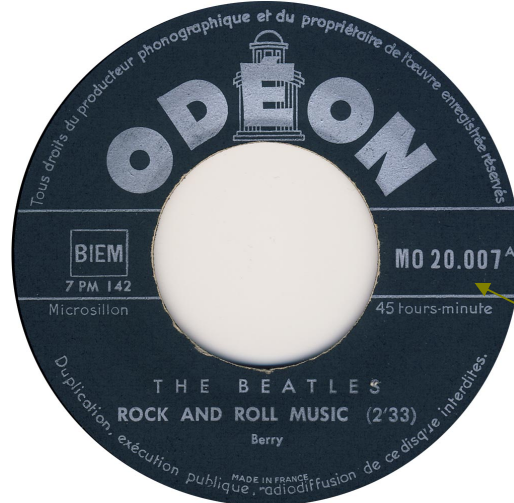
Type 2: with 'dot' in the serial number

Gramophone Belgium, distributor of Belgian Beatles singles in Brussels, decided to press its own Rock And Roll Music MO 20007 single on a purple ODEON label, probably in april 1965. It's the only Belgian Beatles single on a 'rainbow'-type ODEON label. From now on we see 'THE BEATLES' instead of 'LES BEATLES' on the label. Rock And Roll Music /I'm A Loser was a very popular Beatles single in Belgium. The single stayed four months (May - June - July - August 1965) in the Belgian hit parade. Highest position: 3. The single was pressed at SOBEDI Gent Belgium.