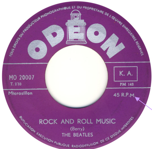
Type 4: Belgian Odéon label K. A. on A-side + dropped 'M' in 'R.P.M'