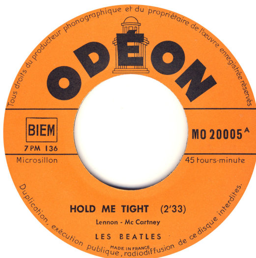
Type 3 : very rare orange label