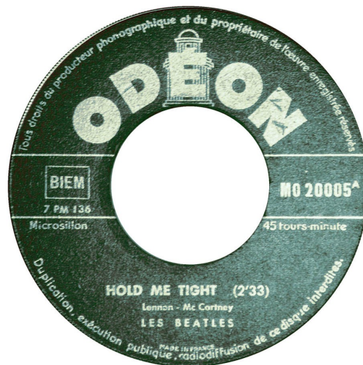
Type 4: The green variant of the orange label