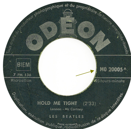
Type 2 : green label, no '7' before 'MO'