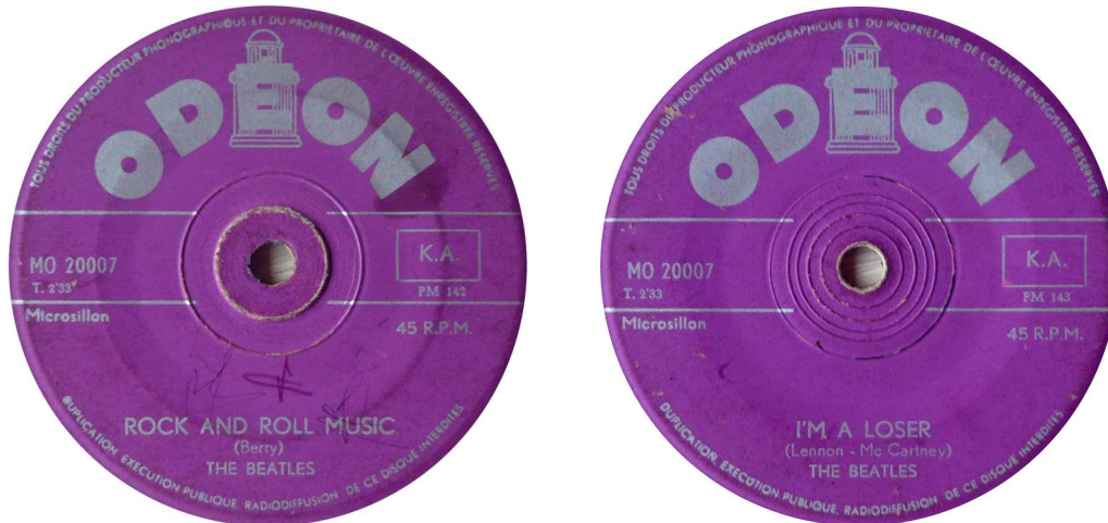
Type 6: small centre hole (print on label is same as type 3). This is the only known Belgian Beatles pressing with a small centre hole.

Characteristics for this Belgian pressing are: