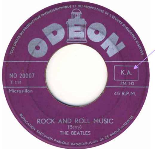
Type 3: Belgian Odéon label K.A. on A-side

Type 3, 4, 5 have only slightly different labels. Look for example at K.A. and K. A. and the position of 'I'm A Loser' versus 'Lennon-McCartney'. Type 6 however is a real surprise and an exception.