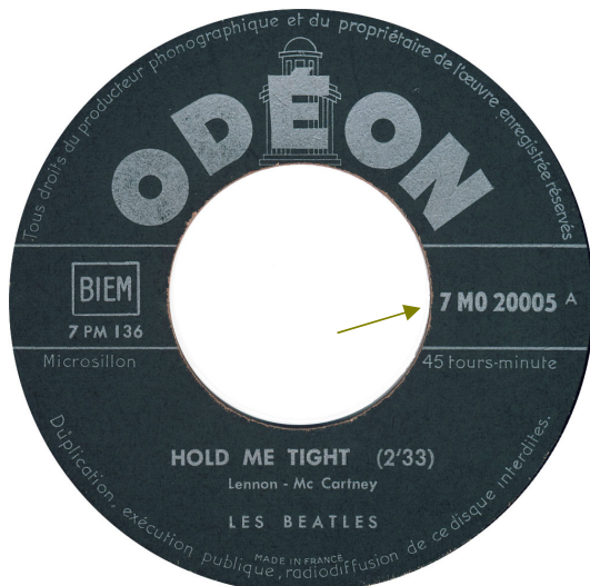
Type 1 : green label + '7' before 'MO' 2