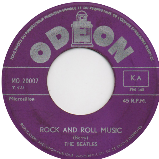
Type 5: Belgian Odéon label K.A. on A-side