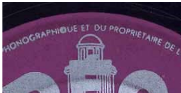
No ridges around the rim (B)