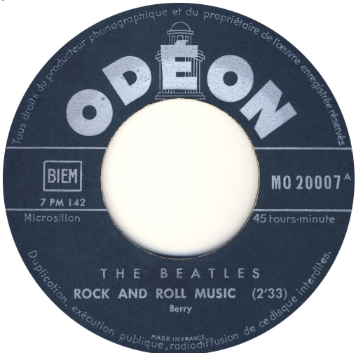
Type 1: no 'dot' in the serial number

This French export single on a dark green Odeon label, was a huge success. Type 1 & 2 were, as we explained, 'Made in France'. EMI-ODÉON France made a mistake however. The timing for Rock and Roll Music ( 2'33 ) on the A-side is wrong. 2'20 is the correct timing for Rock and Roll Music . 2'33 is the timing for I'm A Loser on the B-side. Type 2 with dot is very very hard to find.