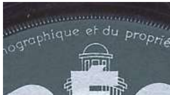
Ridges around the rim (Fr)