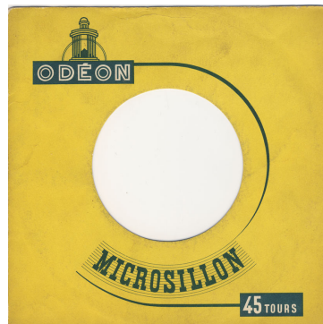
⇐ French Odéon sleeves