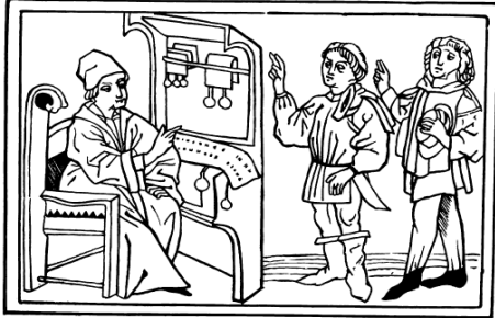
Un Tabellion dans son Echoppe Au Moyen-Âge

A medieval notary in his office. Two sealed documents are hanging, in a chest, whereas the notary has prepared a document with two seals. Two persons with different clothing and hence different social level, are probably swearing to confirm that the contents of the document is the truth.