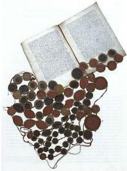
Charter of the “Schwäbischen Bundes”.

On the average 22 seals are fixed to each cords, but the “most important” cords probably carry less than 22 seals. Hence, one or more of the other cords carry more than 22 seals.