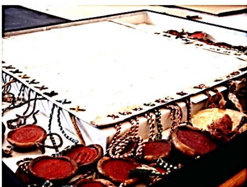
Marriage document, 1590

The ratification is signed on 17th of May 1590 and validated by the seals of 30 Scottish Peers and representatives of the cities Edinburgh, Perth, Stirling, Irvine, Ayr and Linlithgow. The seals are fixed to braided cords at three sides of the document. (05)