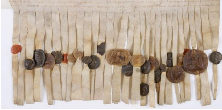
Letter of King Henry III of England, 1263.