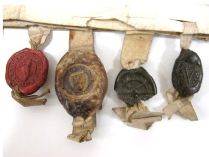
Act of 18th of July 1470 which the inheritance is recorded

At last a document of the 18th of July 1470 in which the order of the four testors is recorded. (11) Four witnesses seal this agreement. It is possible that the "red seal" witness was present, while the seals of the other testors were added later.