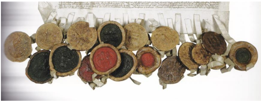
Union of "Wendische" and Saxon Hansa cities in 1476 with ordinary and "cake" or saucer seals

On the 31st of October 1476 a document was ratified between 19 "Wendische" and Saxon Hansa cities (09) These cities used a great variation of seal types. Maybe these seals were sent by the cities as prefabs, as the responsible burgomasters did not attend the meeting. I suppose that some of these prefab seals were too thin and would break easily. Therefore, they were put in a "cake" of "virgin" wax. (10) In Dutch named "komzegel".