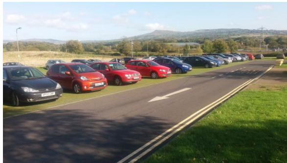
Most cars in the park and ride are for Eco Park staff

Charges should be introduced with discounted or free transport on the park and ride bus service. Upwards of a third of the park and ride car park is taken up by staff from Eco Park businesses during the week. Parking should not be free for those who work at the Eco Park. Charges will encourage those workers that live in Ludlow to use buses and the companies at the Eco Park to create more parking spaces.