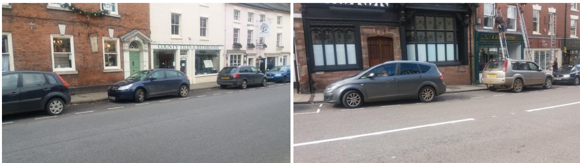
Marked bays would increase on-street parking spaces

Parking bays should be marked to encourage tighter parking. This would create around 20 extra spaces in the Red Zone and more in the Blue Zone.