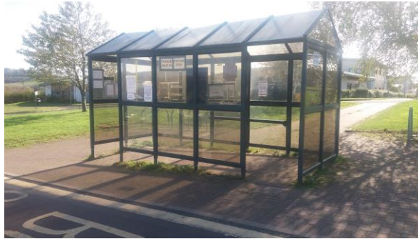
Eco Park bus shelter

Transport and parking strategy in Ludlow should be built around the park and ride service. Facilities at the Eco Park should be improved, including a weatherproof bus shelter and toilets. The car park surface and signage should be repaired or replaced.