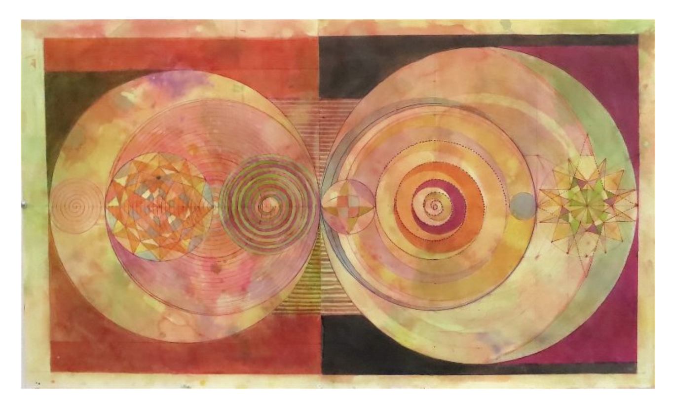
Laura Battle, Untitled (Red/Black), 2024, Mixed Media on Paper, 22" x 38".

Intricate graphite, ink, and watercolor drawings along with large-scale oil paintings make up Laura Battle's contribution to the show. Inspired by the patterns found in nature, such as the ebb and flow of ocean tides or the circling sweep of swallows, as well as ancient diagrams of the universe and ways of measuring time, Battle's complex geometries and sensitively rendered colors lead viewers into a world of heightened order and emotive energy. Her art explores the relationship between structured design and spontaneous creation; each piece, some with upwards of 4000 lines, offers exciting optical effects and unexpected compositions that become intense spaces with visceral impact and a universally relatable visual language.