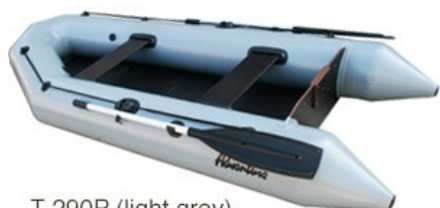
T-290P (light grey)