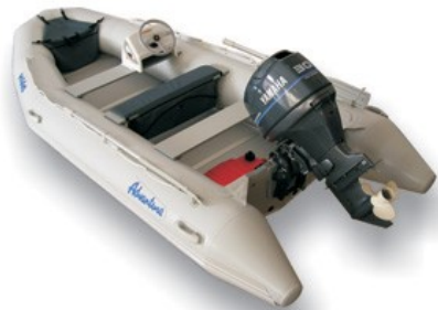
M-440 (optional version)