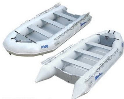
M-400 (light grey)

Modern unique high-technology Italian style welded inflatable buoyancy tube with three hermetically-separated chambers Continuous 12 mm-thick reinforced marine-ply floor Two removable wooden seats Two oars with oarlocks, and twin tube-mounted oar supports Safety grab-ropes on tubes Bow towing ring, and rear ring for anchor rope Superb rucksack for carrying and storage of the boat and accessories Foot-pump with valve adaptor Emergency repair kit in plastic container, including material and adhesive Operation manual