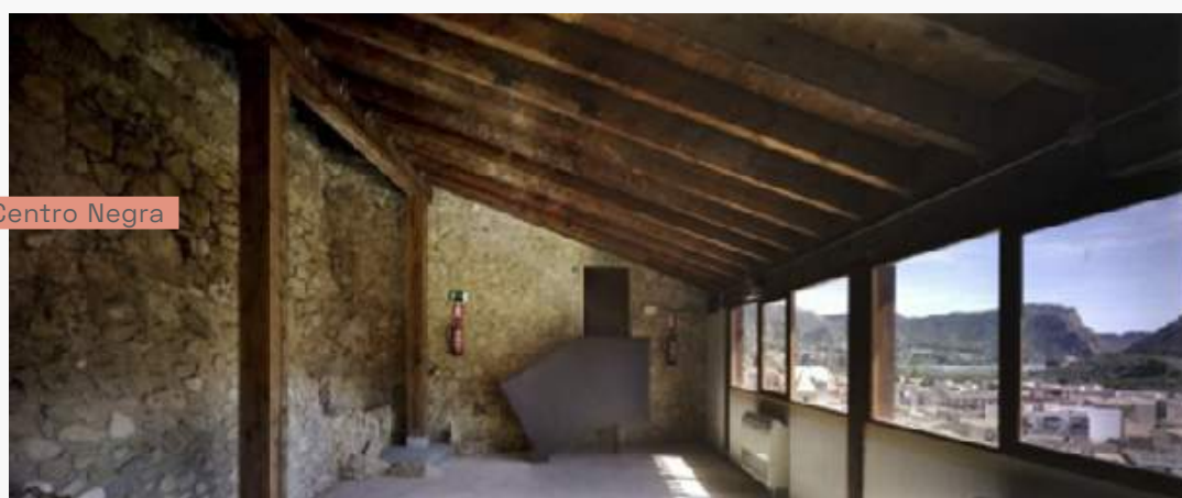
Studio in Centro Negra

Centro Negra is the main building of AADK Spain and functions as a work area and exhibition space. It is located on the side of the mountain, under an old Moorish castle from the 12th century, and can only be reached on foot . Its architecture recovers old poultryards for animals and small houses from the beginning of the 20th century. It preserves original stone walls and mountain rocks. Currently, the building is made up of 6 different and interconnected spaces. Each of them is unique in its scale and morphology.