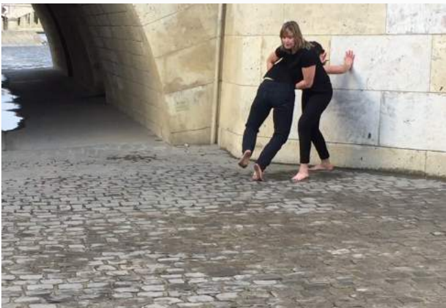
duet (Paris, 2019)