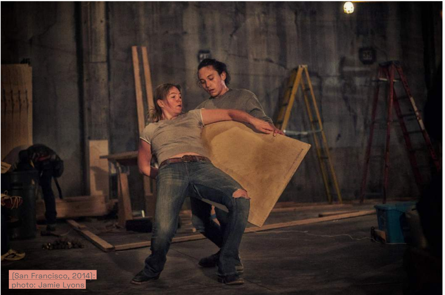
(San Francisco, 2014): photo: Jamie Lyons