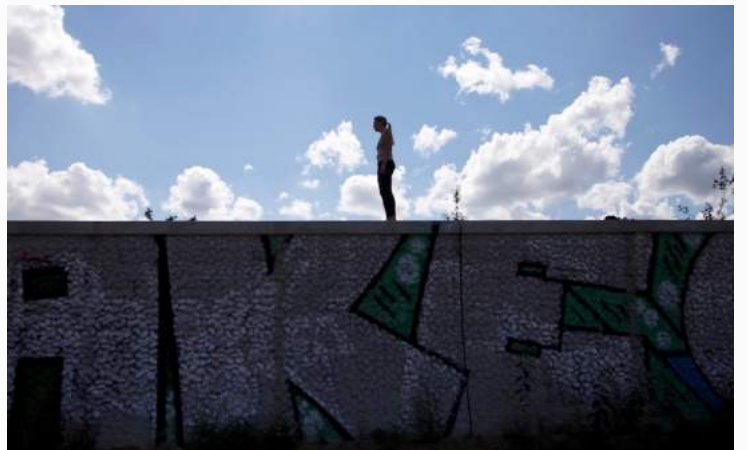
230 Steps (Berlin, 2012)