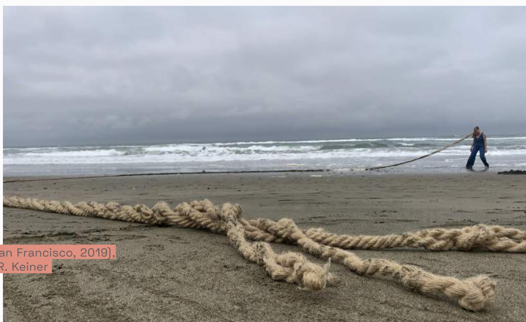
SLACK (San Francisco, 2019)

The Performance Intensive is carried out in Centro Negra, the current headquarters of AADK Spain. This special site combined with the unique spatio-temporal practices of our lead artist will offer participants the opportunity to work in ways that normal teaching environments and linear time schedules do not allow. The rhythms of our bodies, surrounded by rocky mountains, the Segura River, and citrus orchards will be listened to and explored. Tuning the natural elements with your capacity to embody and to express your inner landscape, you will develop tools for an Ecosomatic artistic practice.