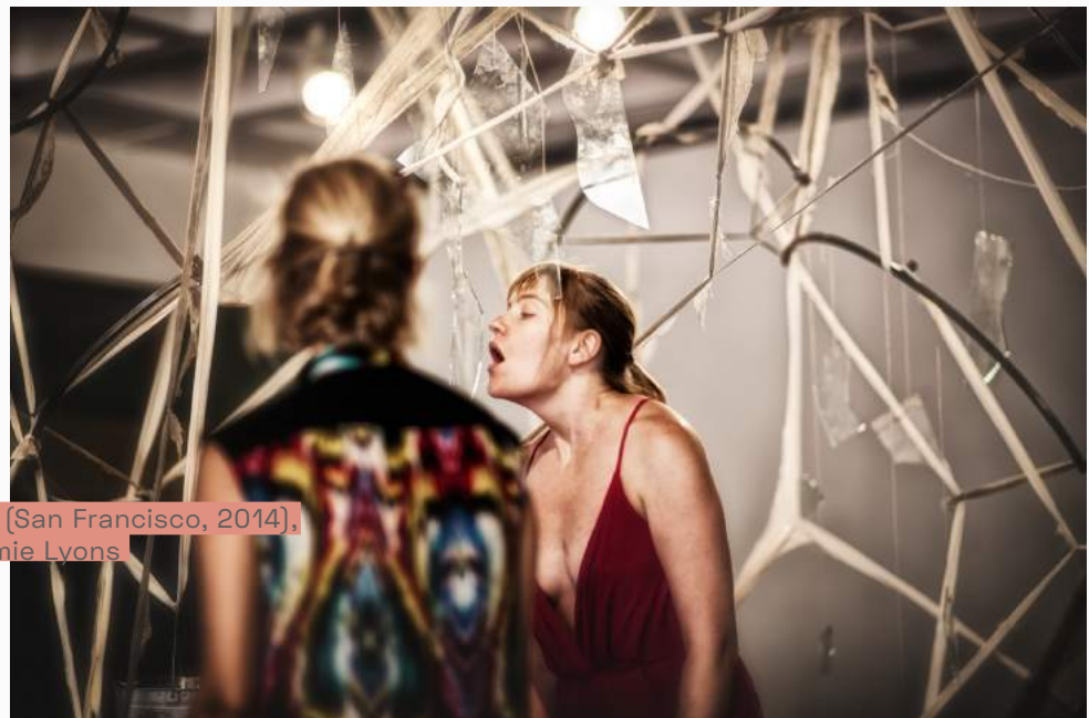
Exchange (San Francisco, 2014)